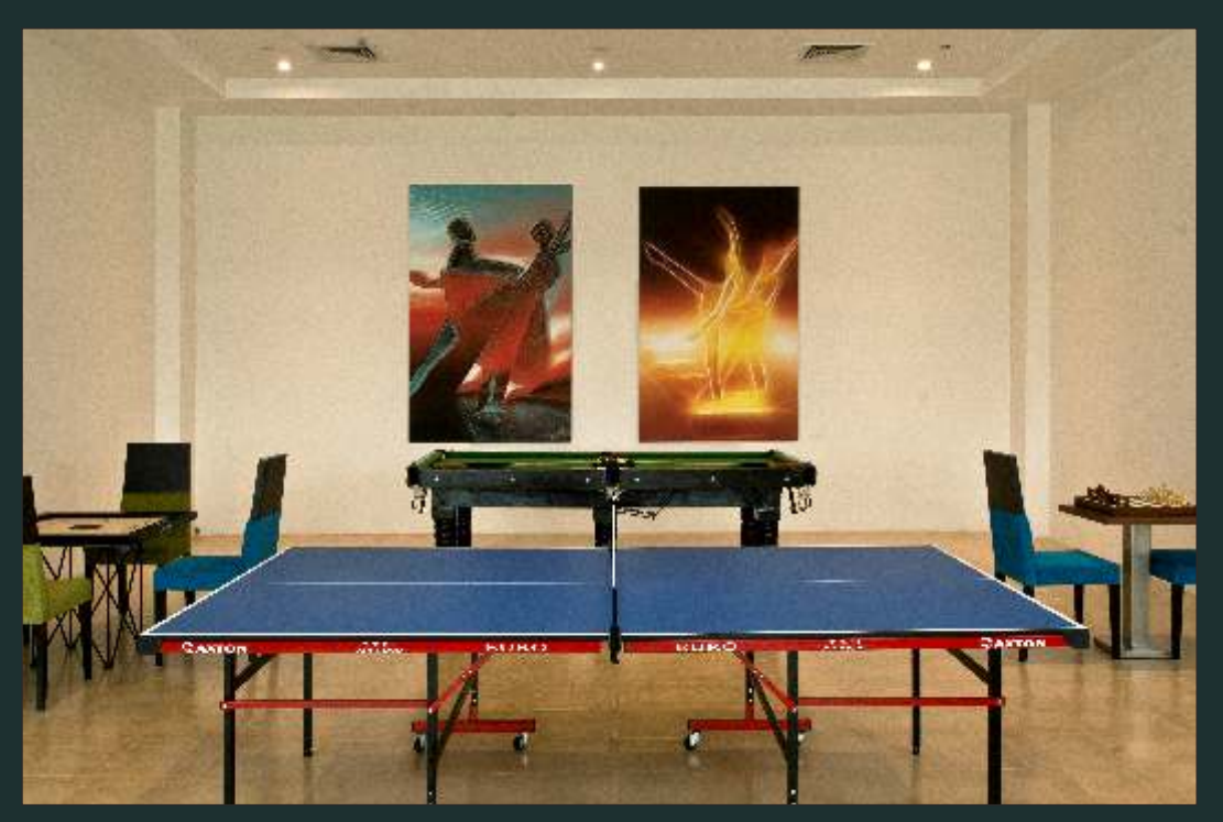
Table Tennis Snooker